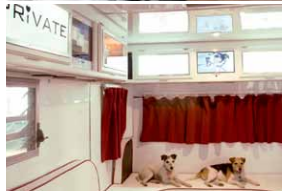
The TMU, deployed. The Archway, DUMBO, Brooklyn, 04 August 2011 (top)

B: Our original plan for the TMU was to tow it cross-country, making art along the way and filming a documentary of our travels. Our destination would be an art exhibition somewhere on the west coast, where we would show the paintings that Tillie created en route. We currently intend to bring the Unit to a few locations between now and the end of the year, culminating in a visit to Art Basel Miami in December. We will set off for the west coast in Spring 2012... unless we decide to tour Europe first. #